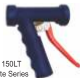
150LT Lite Series