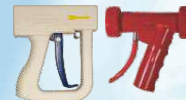
The New "X" Nozzle Extended Bacteria and Chemical Resistance

SuperKlean industrial hot water nozzles, swivel hose adapters, and hose accessories are the most requested hot water sanitation solutions in factories and plants.