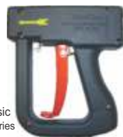
Classic DH Series