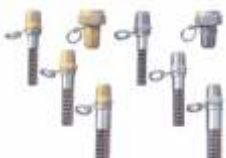
Swivel Hose Adapters