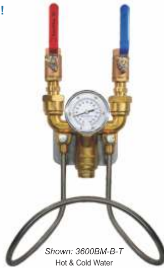
Shown: 3600BM-B-T Hot & Cold Water Mixing Unit

AVAILABLE WITH GLOBE OR BALL VALVES SuperKlean 3600's are always in stock, along with the washdown industry's best nozzles, adapters and hoses.